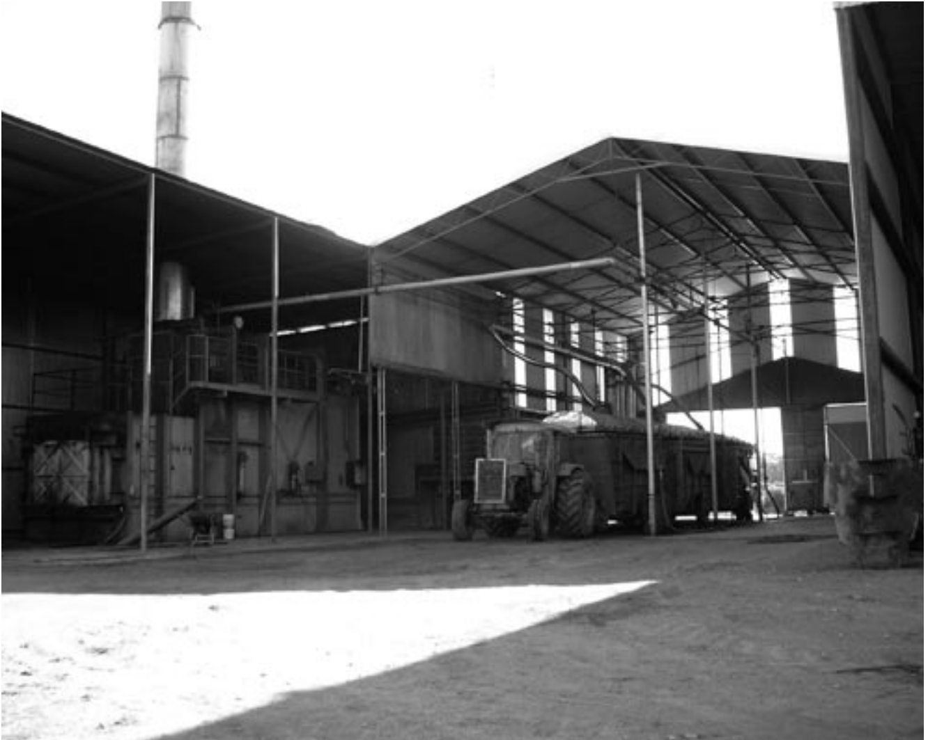
GR Davis's blue mallee distillery at West Wyalong, NSW: All feedstock should be produced within 50 km of a processing 'energyplex' to ensure that energy profits and greenhouse savings are maximised. The entire energy requirement of the bio-methanol transition will take 8% of usable fuel produced.

damage 19 . The Chinese conclusion was that methanol was the safer fuel. A full evaluation of methanol hazard or otherwise is beyond the scope of this article, but two things are clear. First, methanol's direct hazard is a little more than ethanol and can be contained by different fuel delivery systems and consumer training. Second, methanol is more cleanly and completely combusted in engines and fuel cells and thus releases appreciably less airborne toxics which impact on human health.