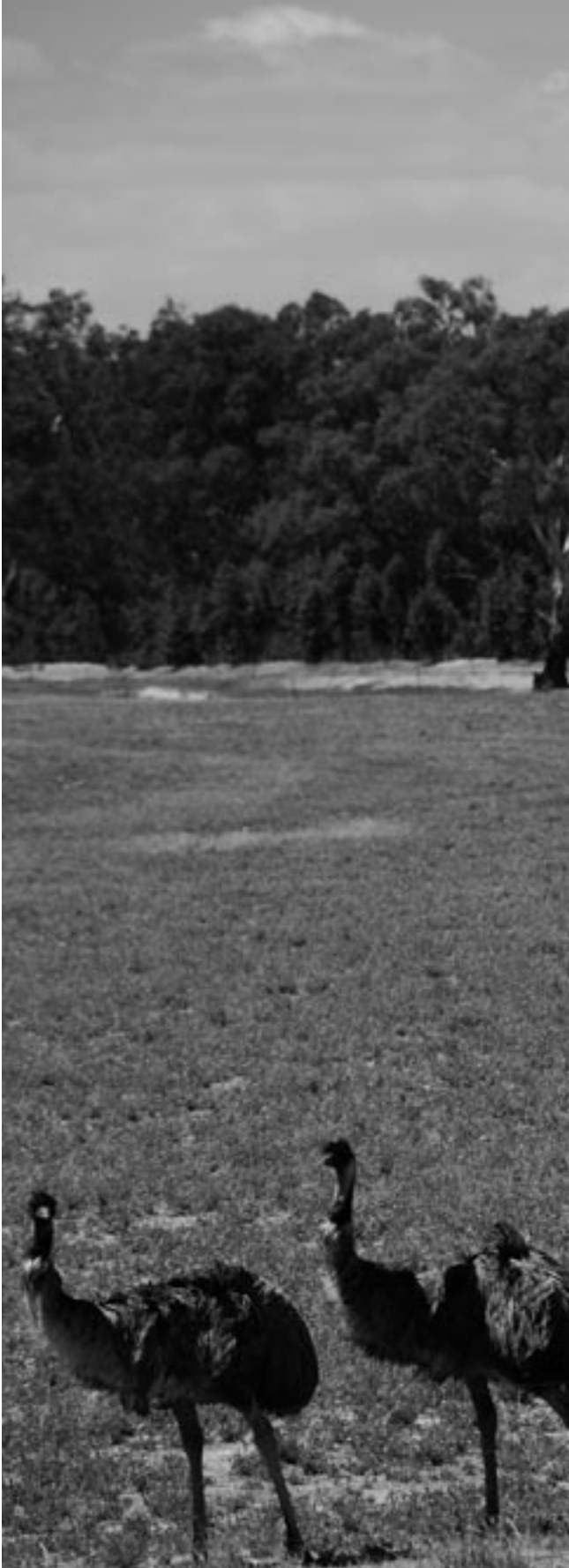
In marginal and intensive farming zones, plantations for biomass will improve biodiversity by pursuing a mixed indigenous species approach when planting.

Analyses at this aggregated scale do not prove any non-impacts of such large plantings. Rather they sketch the physical plan of how a bio-methanol transition might work and highlight where the potential contribution of a region might be threatened by more important issues. Large scale sub-catchment modelling and regional land use plans would then be required before national feasibility in aggregate could be assured.