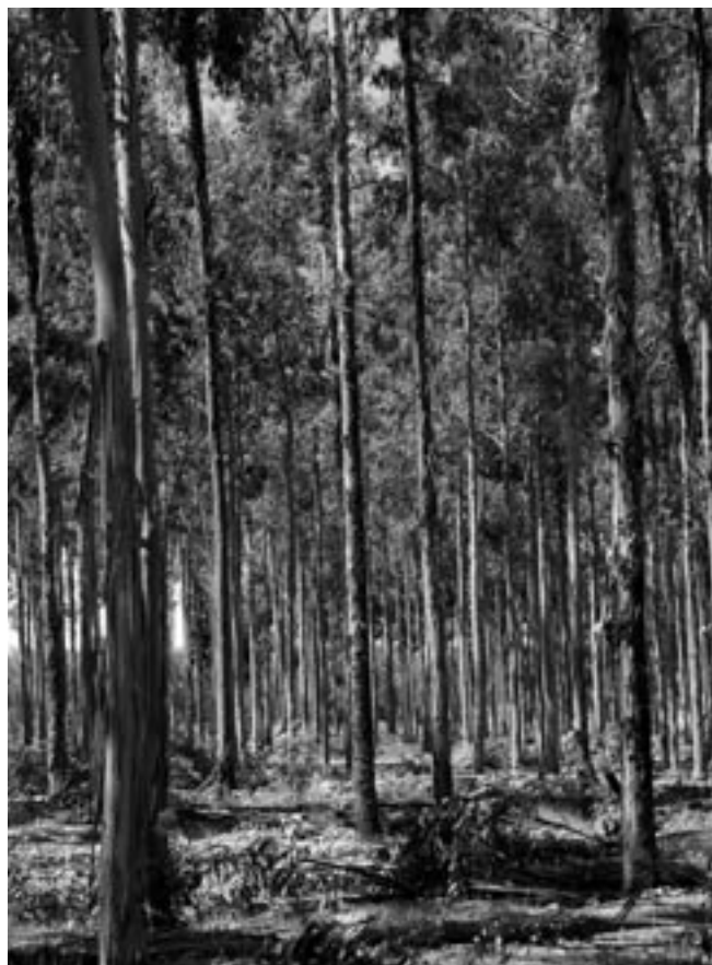
As well as traditional long rotation forestry, the bio-methanol transition would need well developed production regimes that suit environments on 60 million hectares of Australia's tamed landscapes.