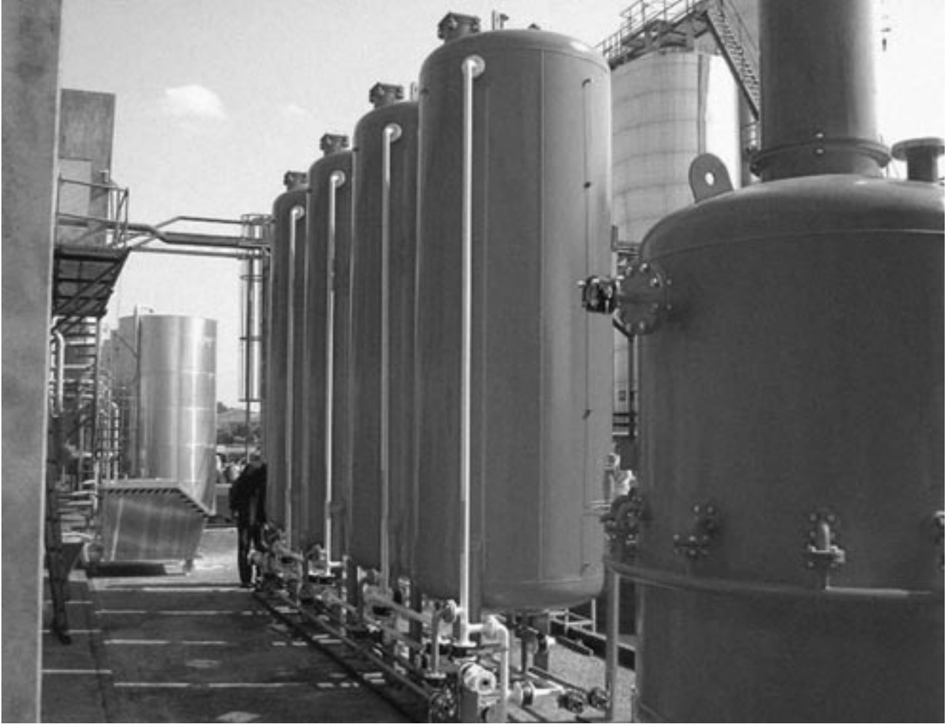
Catalyst chemistry is at the heart of the bio-methanol transition and will require significant skilling up of teaching and research facilities at Australia's regional universities.