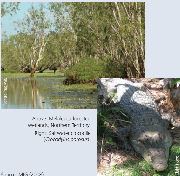
Above: Melaleuca forested wetlands, Northern Territory. Right: Saltwater crocodile ( Crocodylus porosus ).

Harvested eggs are hatched in farms. The crocodiles are grown to the desired market size and then used for skin and meat production.