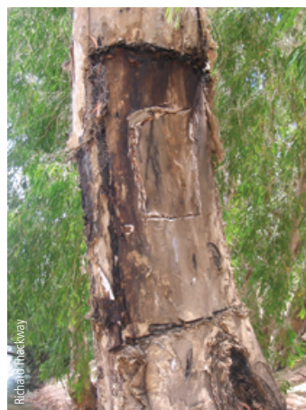
Bark harvested from melaleuca to make plates for food, Robinson River, Northern Territory.

Indigenous people in parts of the Northern Territory traditionally use the bark of long-leaved paperbark for many purposes, including for sheaths to hold stone knives and spearheads, as tinder for starting fires, to cover baking food, as a component of fish traps, as a material for blankets or capes, and to make canoes. The flowers can be sucked for nectar or soaked in water to make a sweet drink.