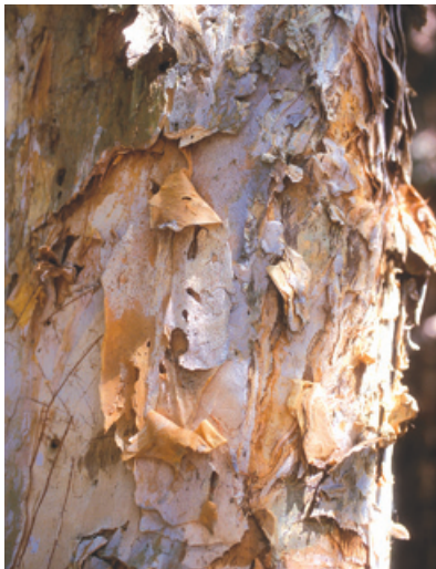
Light flaky bark is typical of some melaleucas.

The word 'melaleuca' comes from the Greek melas (meaning black) and leucon (meaning white) and, when first coined, was probably a reference to the fact that some species have white bark over an inner layer of black bark, although it might also have referred to trees with white trunks and bases burnt black by fire, or to the black trunks and white branches of some Asian species. Another commonly used name for melaleuca is