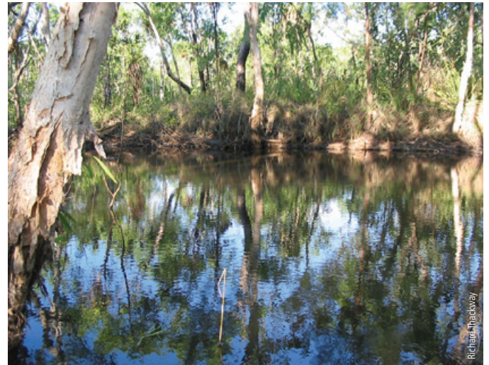
Narrow strip of melaleuca on both sides of a stream, Northern Territory.

Melaleuca forests occur mainly as large tracts of low woodland forest across estuarine plains and seasonal swamps