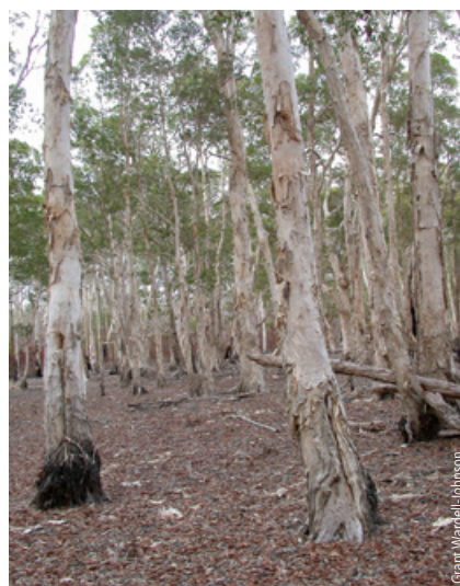
Seasonally waterlogged stand of Melaleuca leucadendra near Lockhart River, Cape York.