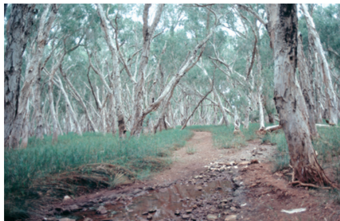
Weeping paperbark ( Melaleuca leucadendra ) Pilbara, Western Australia.

Plantations of some melaleucas, particularly Melaleuca alternifolia , supply the raw material for the tea tree oil industry. Tea tree oil is an effective antiseptic and is used in creams for cuts and abrasions, shampoos, soaps, mouthwashes and toothpastes. Paperbark is used in the horticultural industry as a lining for hanging baskets. Melaleuca flowers are important for apiarists as a food source for bees and are sometimes known as 'honey myrtles' for this reason.