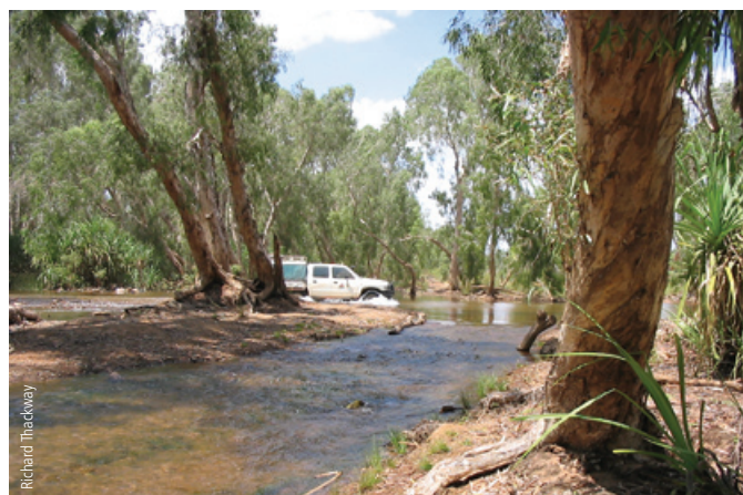
Riverine melaleuca forest, northern Australia.

Nationally, 72% of melaleuca forest occurs on leasehold land and 16% on private land (Table 2). In both cases, the main land use is grazing for cattle production. Only 8% of melaleuca forest is within nature conservation reserves, while about 2% is located in multiple-use public forest or on other Crown land.